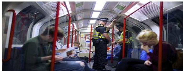
Police officers patrol the London underground.

theguardian.com, Tuesday 1 October 2013 07:00 BST Jump to comments (...)